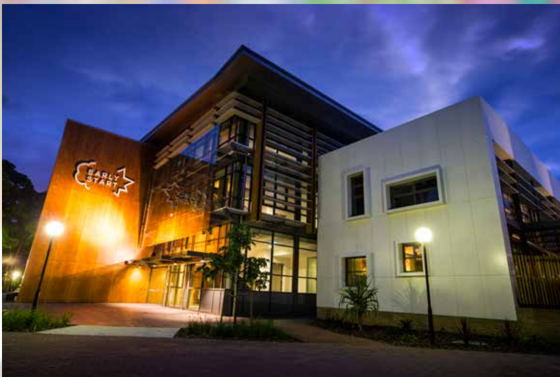
[Above: Early Start™ Facility]

41 Early Start™ Engagement Centres (ESECs) form a network of early childhood and family services predominantly situated in areas of recognised disadvantage across NSW and the ACT. These centres provide portals into their communities and will facilitate multidirectional interactions, grounding teaching and research in real life settings and providing authentic learning opportunities for students and researchers across many disciplines.